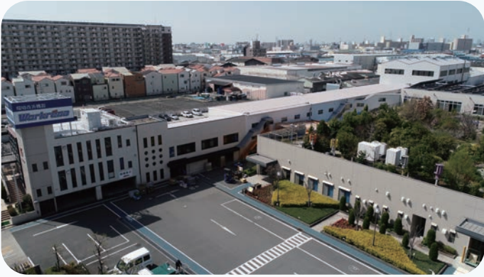
Osaka Head Office Factory (Osaka prefecture)